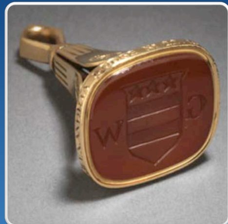
Photograph of George Washington seal, Collection of the U.S. House of Representatives.

A great history class discussion starter – why would the Confederate States approve such a seal harkening back to George Washington?