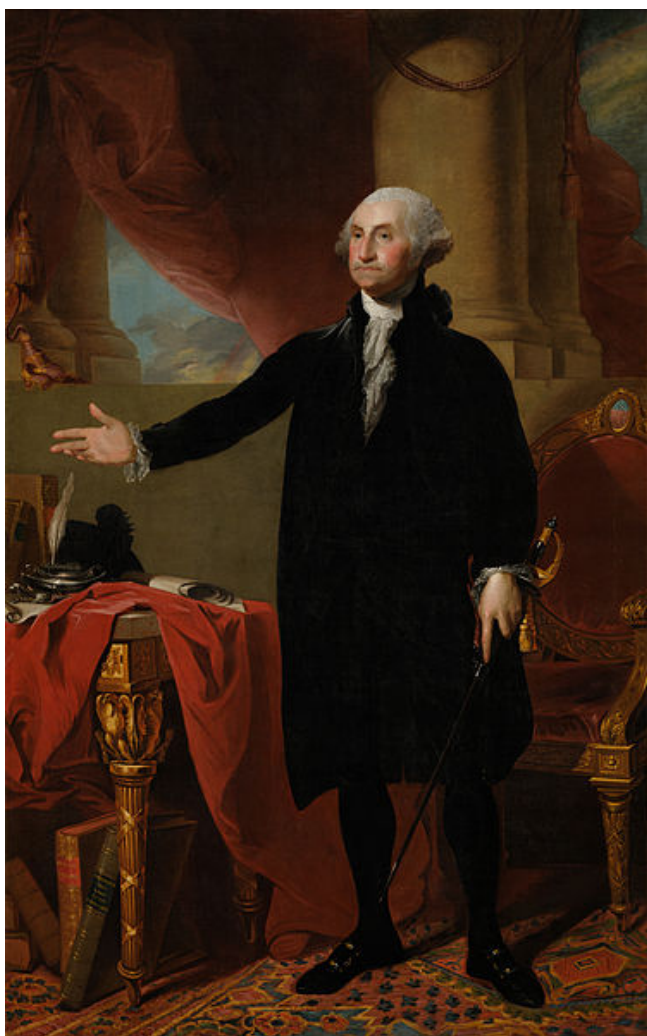
Gilbert Stuart's "Lansdowne Portrait" of George Washington (1796)

In our 11 th grade history classes a normal approach would include: