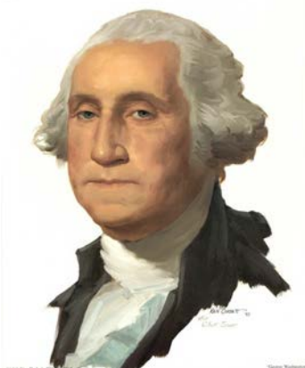
Painting by Ken Corbett, 1997.

Light reading (by this, I mean books of little importance) may amuse for the moment but leaves nothing solid behind [letter to George Washington Parke Custis – November 13, 1796].